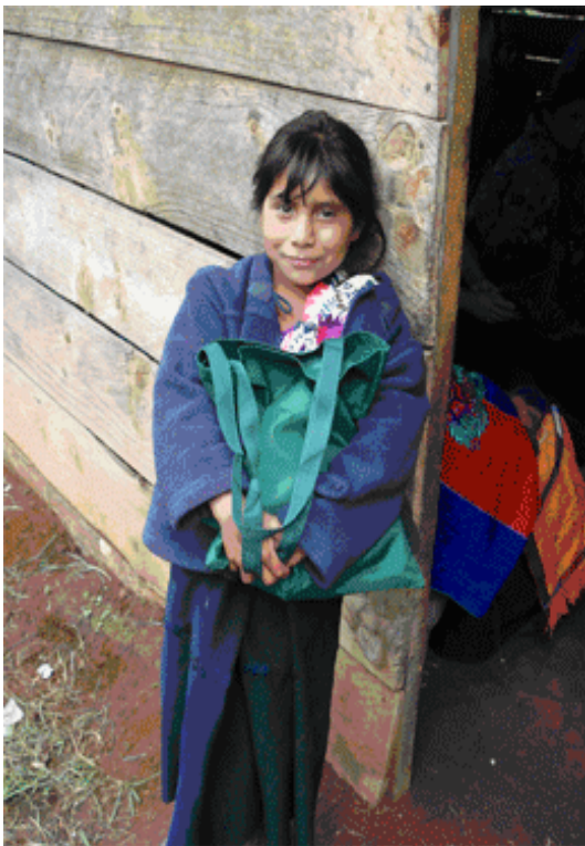
A child of San Isidro clutching bag of school supplies

Your donations have helped Mayan children have a chance to get an education and a better future. Why not join us to bring some early Christmas cheer to these children and see for yourself what has been accomplished and what still needs to be done?